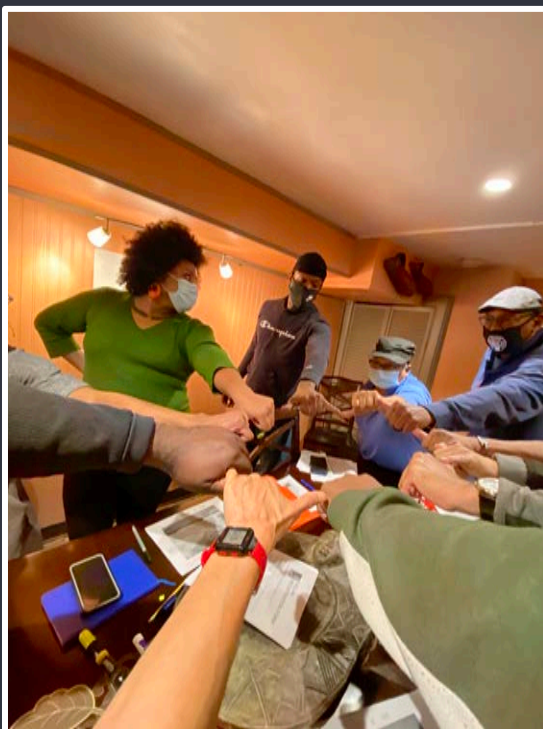
New Member Orientation Fall 2021