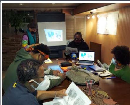
Base Building Committee hosts new member orientation. Fall 2021