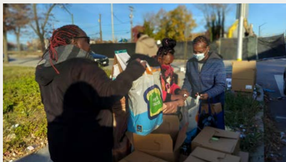
Own Our Hood program providing mutual aid. November 2021